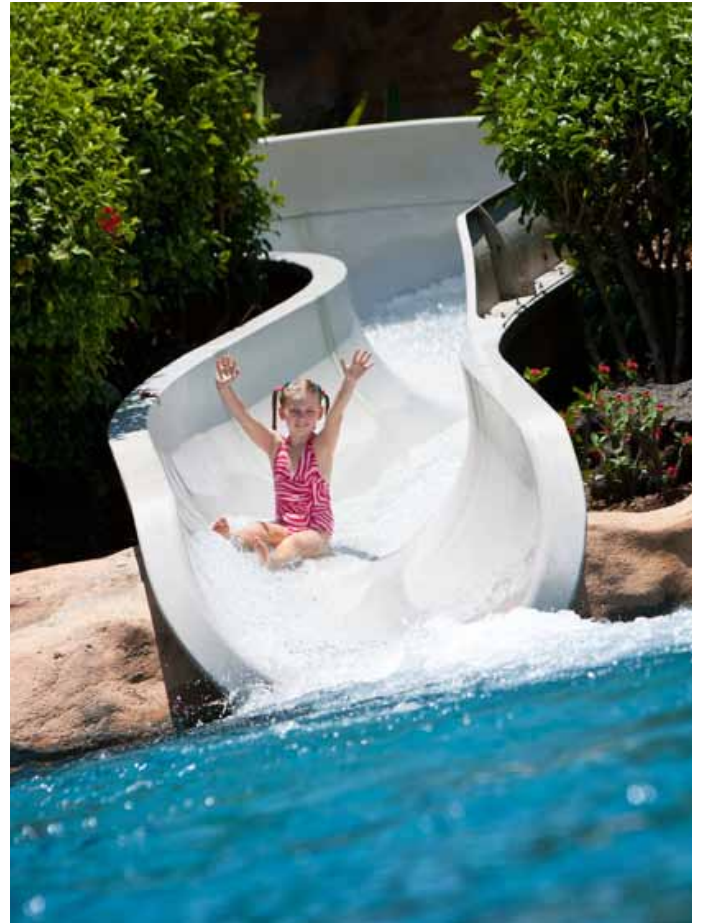
The pool area will have your children swim and play until the sun sets.

Pan Pacific Bali Nirwana Resort takes pride in celebrating the blending of Balinese nature, tradition and spirituality with its unique sensual retreat, relaxation meditation, health, wellness and spiritual rejuvenation.