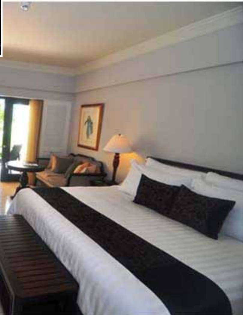
Your Pan Pacific Nirwana Bali Resort room is a spacious and newly renovated “home away from home” that faces the tropical garden...