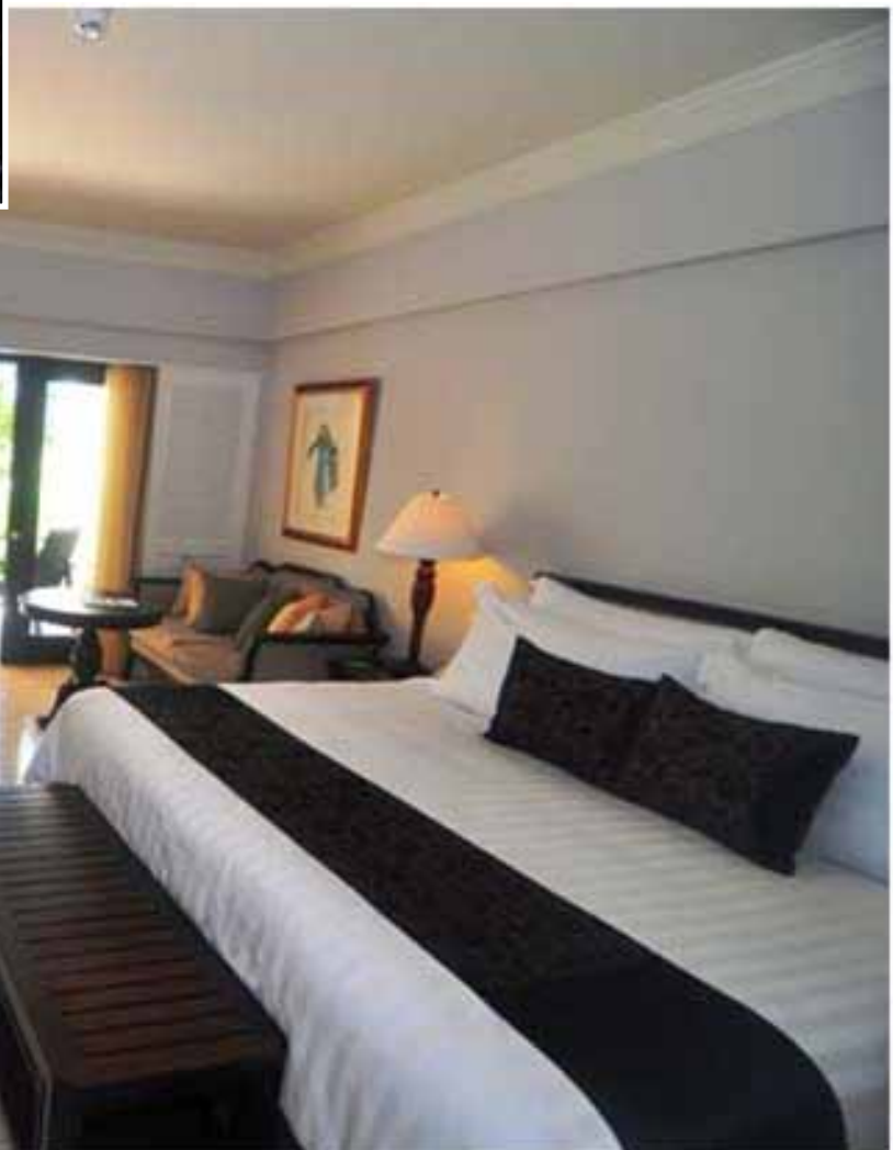
Your Pan Pacific Nirwana Bali Resort room is a spacious and newly renovated “home away from home” that faces the tropical garden...