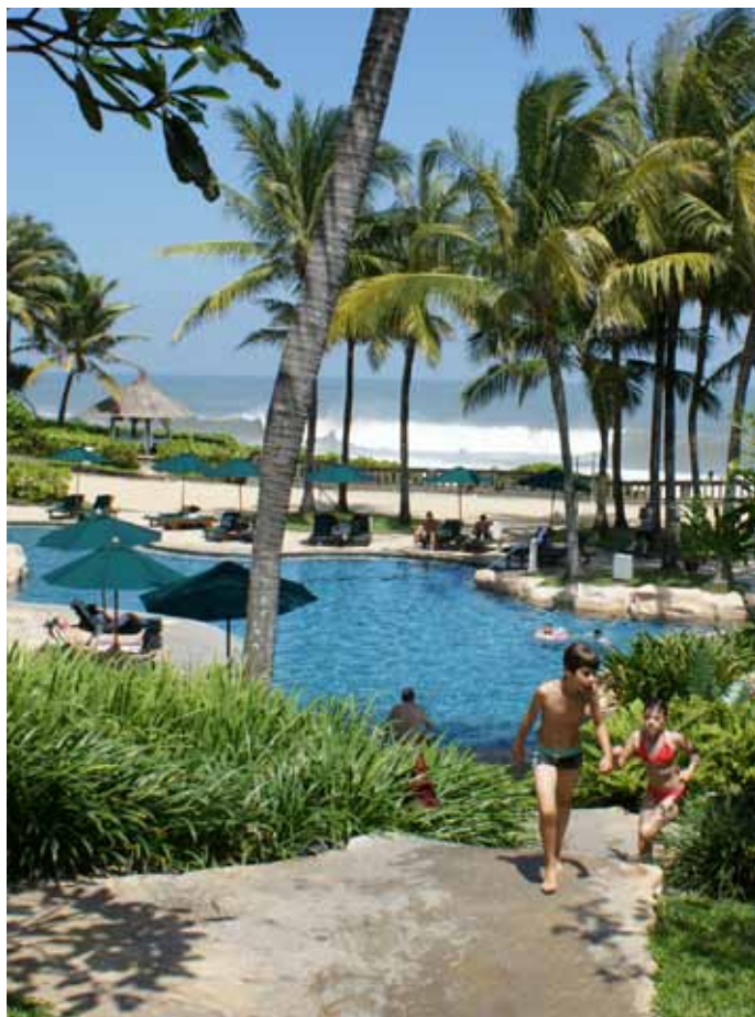
The pool area will have your children swim and play until the sun sets.

Pan Pacific Bali Nirwana Resort takes pride in celebrating the blending of Balinese nature, tradition and spirituality with its unique sensual retreat, relaxation meditation, health, wellness and spiritual rejuvenation.